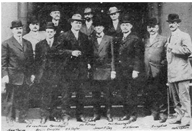
The Association's first Board of Directors, 1909.

To get a sense of how long ago this was, here's a photo of the first Board of Directors at a meeting in Chicago in 1909.